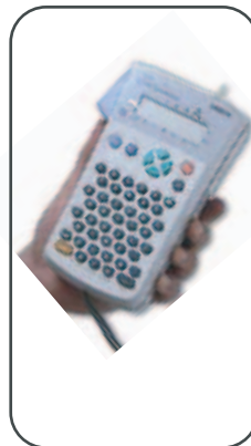
1. Type Message