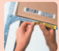
Multi-function Use as stencil printer and label printer