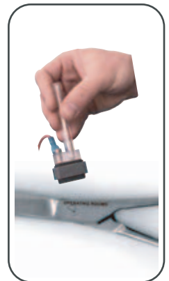
3. Etch Part