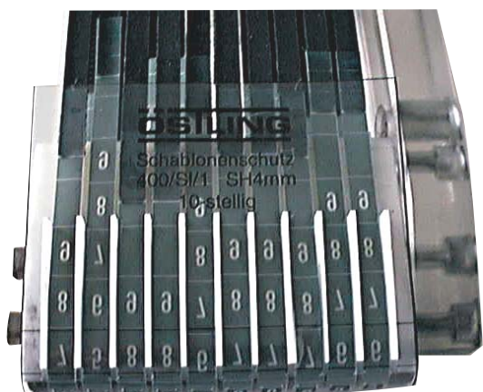
Character size 1.5mm

While this system is a little easier to use than the variable numbering stencil, numbers are required to be spaced a short distance apart.