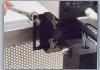
Quick and easy installation