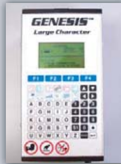
New graphics controller