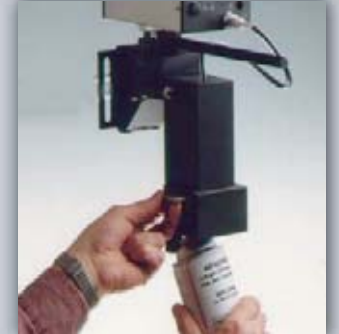
No mess ink cartridge