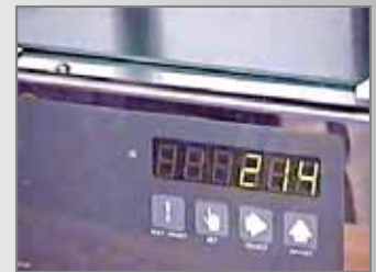
User-friendly control system